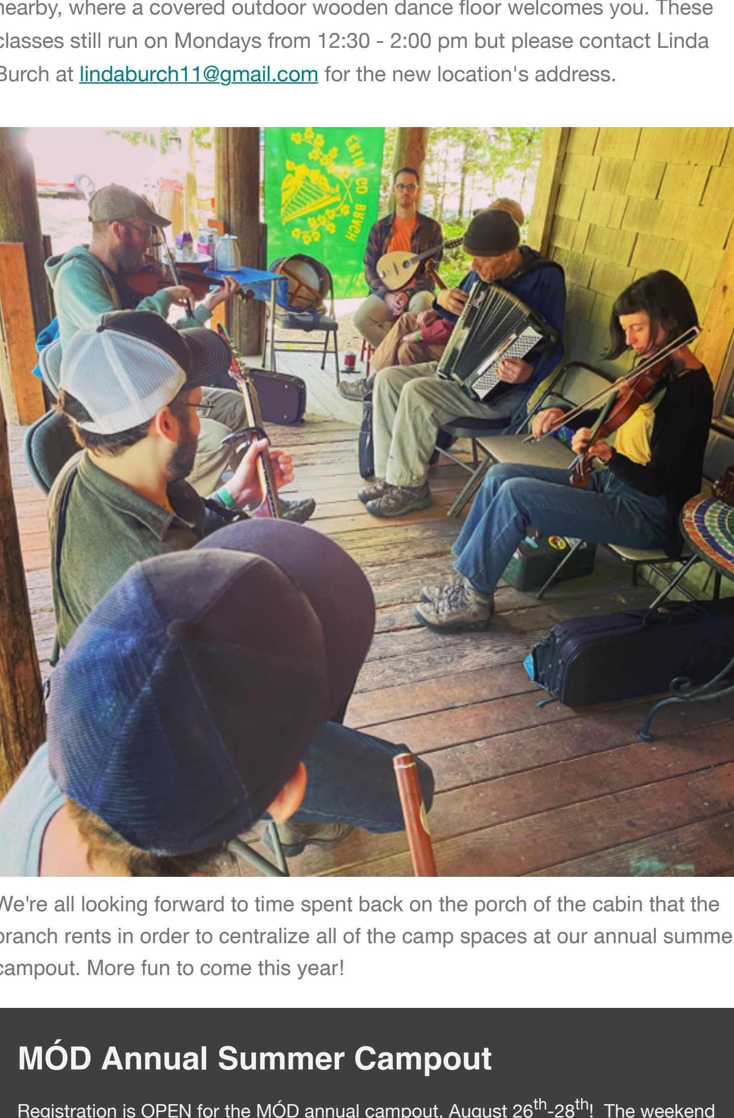
We're all looking forward to time spent back on the porch of the cabin that the branch rents in order to centralize all of the camp spaces at our annual summer campout. More fun to come this year!

Venue change for FREE Sellwood Community House set dancing classes: In order to accommodate summer camp programming at the Sellwood Community House, set dance classes will be relocated to a private residence nearby, where a covered outdoor wooden dance floor welcomes you. These classes still run on Mondays from 12:30 - 2:00 pm but please contact Linda Burch at lindaburch11@gmail.com for the new location's address.